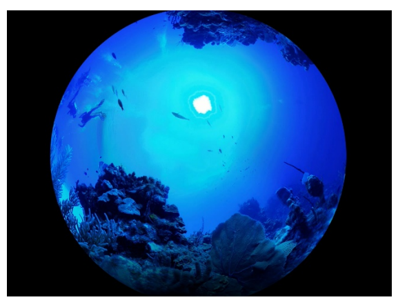
Fig. 4: Snapshot from the 360 degree-footage, Reefs of Belize. This clip is used to visually support the topic of ocean acidification.