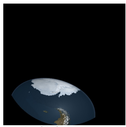
Fig. 3: Snapshot of clip from Dynamic Earth showcasing Earth's polar ice caps. This clip is used to describe the differences between sea ice and land ice when it comes to sea level rise. Credit: NASA/Goddard Space Flight Center Scientific Visualization Studio.

We used a variety of visuals to complement the program narrative, including the built-in capabilities of Digistar7, like flying to the Moon, Mars, and Venus. We used several of NOAA's Science on a Sphere datasets to visualize the effects of climate change. We also used clips from various sources – like Dynamic Earth's land and sea ice clip (Fig. 3), footage from divers in the Belize Barrier Reef (Fig. 4), and stock footage of storms, droughts, and fires.